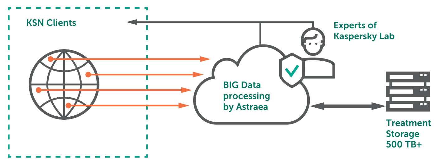
Fig.1 - Scheme of data transmission between KSN elements