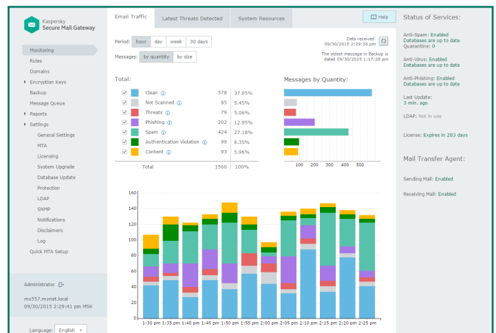
Kaspersky Secure Mail Gateway' web console